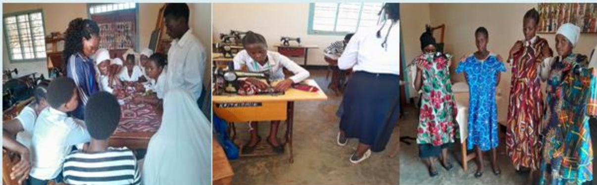
Photo 1: Students during practical lessons while others displaying tailoring products they made.

through training. Assessments done daily using assignments and they are tested through internal examinations supervised by the management.