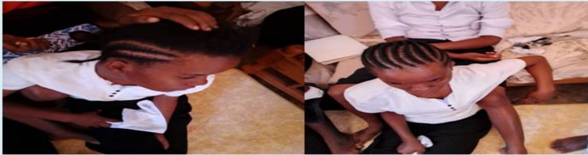
Photo 4: Girls students during hair dressing practical session at Kiwamwaku Foundation compound.

Salon class in another class for business and aimed to better lives for these special human being. This year we registered 20 girls' students who are undertaking their studies at Kiwamwaku Foundation premises/classes. These girls covered salon principles; such as customer care also they are are able dress different handily African hair styles, apply different Rasta designs such as mabutu and yeboyebo.