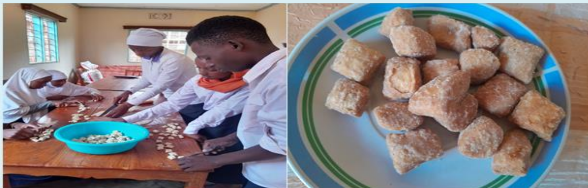
Photo 2: Students participating in making bites during cooking session at Kiwamwaku Foundation compound.

The class is designed to support nutritional and cookery business skills. Originally was established from the background that some of these students are PLHIV so they need special attention when it comes to meal so special training was essential also it was found from such training a business can be created for them to get employed or employing themselves. It was from Jan-June, 2023 these students learnt cookery basic terminologies, food preparation techniques such as baking and frying specifically deep frying using cooking appliances (oven, stove and other utensils), preparing balanced diet and general cooking hygiene. Learning covered some different bites such as Chapatti, scorns, half cakes and baggies.