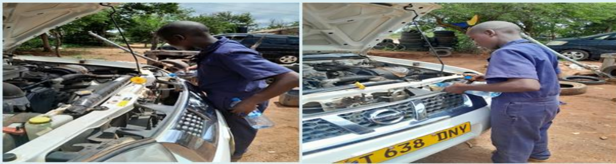
Photo 5: One of the mechanic students adding water to a vehicle as a practical lesson.