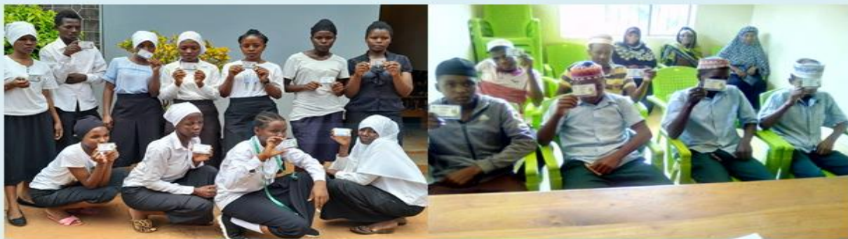
Photo 11: Boys and girls students showing their Health Insurance Cards.