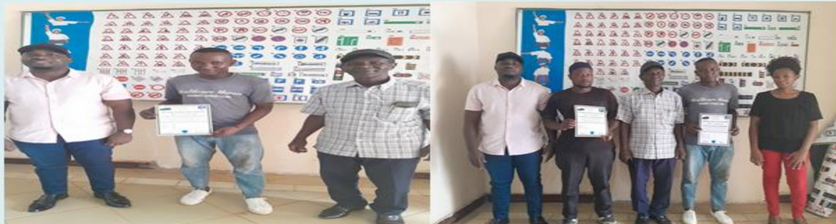
Photo 6: Two mechanic students attended a driving class for one month at Wereni Driving School in Mwanga.

In this year to have two (02) boy's students (from mechanics class) took driving lessons for the period of one month at Wereni driving school which is located in Mwanga. During the course the students learn the basic of car driving, control and they drove two hours in both highway and local roads. They also learn navigating and roundabouts, changing gears and signals and road marking. It is interesting that they were able to get this training that will help them to better their mechanic skills.