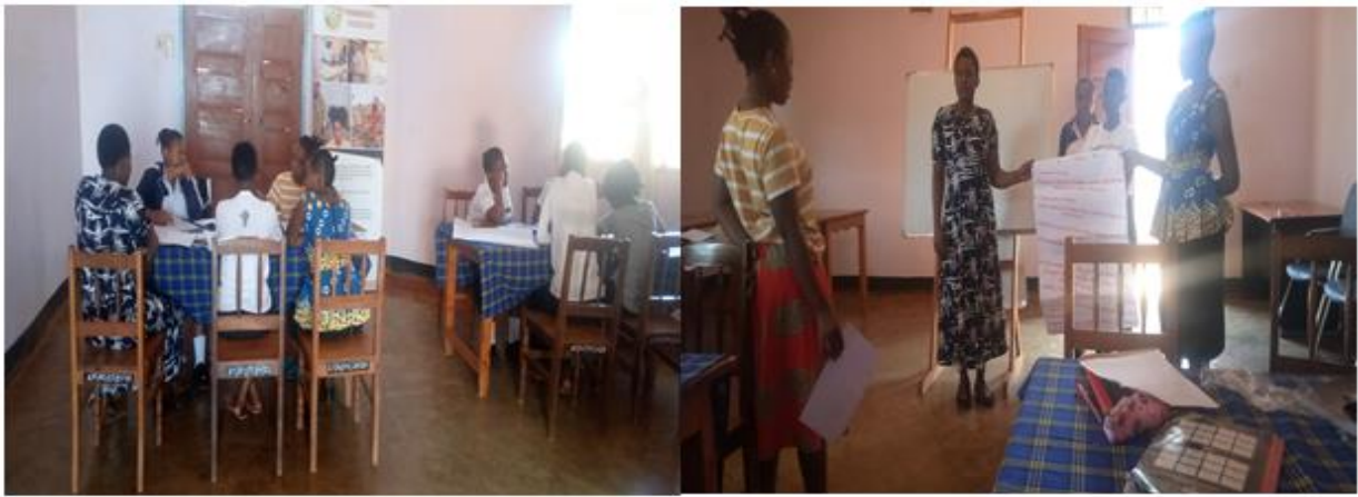
Photo 3: Students discussing advantages of computer in relation to programe they undertake (cookery, saloon and tailoring).