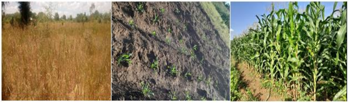
Photo 9: Photos taken before farm slashing and after seed planting and the current status.