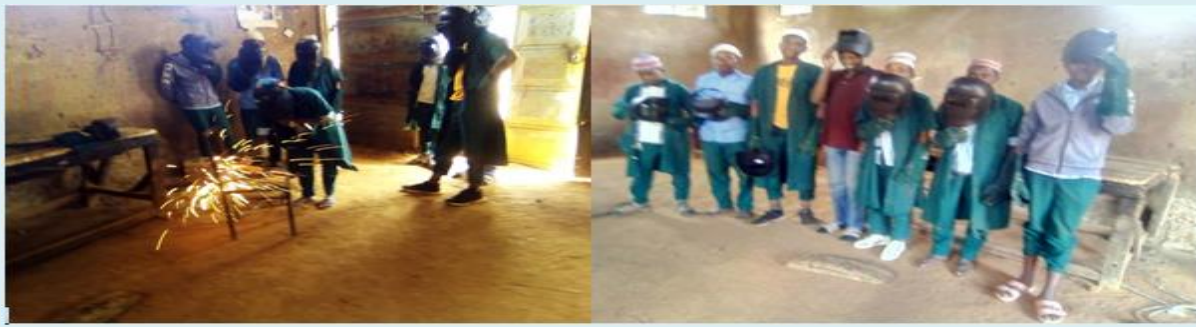
Photo 7: Welding students from Kirongwe Vocational Center during practical lessons and the other photo was taken during the receiving the protective gears.

Specific Objective 6: To enhance knowledge and skills of 05 vulnerable youth (04 boys and 01 girl) students in agriculture production in Mwangi District by December 2023.